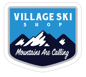
CL208 | Screen Printed Patch