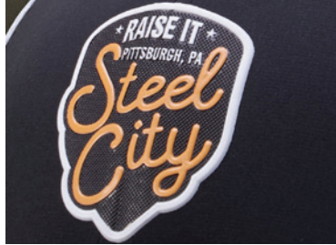
OD124 | NON-METALLIC POLY PRESS TRANSFER