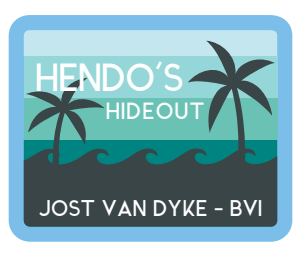
OD268 | Sublimated Patch