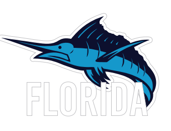
OD230 | Standard Embroidery