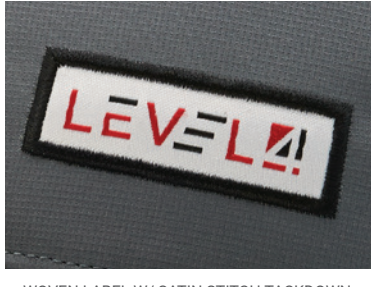
WOVEN LABEL W/ SATIN STITCH TACKDOWN