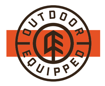
CL140 | Screen Print Transfer