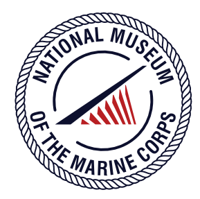
0D243 | Laser Cut Embroidered Patch