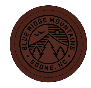
CL180 | Debossed Leather Applique