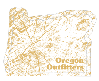
OD214 | Faux Leather Applique