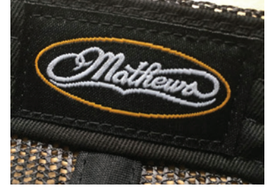
WOVEN INTERNAL LABEL