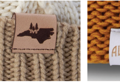
LEATHER CLIP LABEL