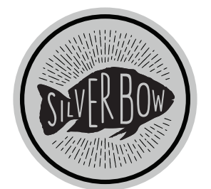
OD320 | Heat Pressed Faux Leather Featured on style 933, page 7