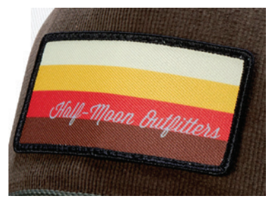
OD263 | SUBLIMATED PATCH