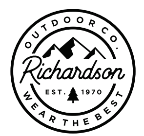
OD300 | Silicone Transfer