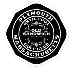
OD280 | Screen Printed Patch Featured on style 225, page 23