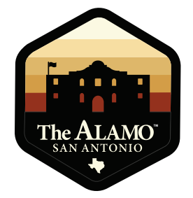
OD270 | Sublimated Patch