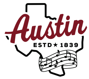
OD294 | Silicone Transfer