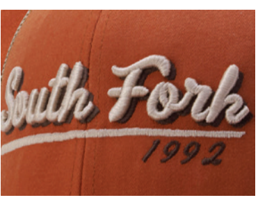
CL115 | 3D EMBROIDERY