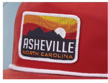
OD044 | EMBROIDERED PATCH