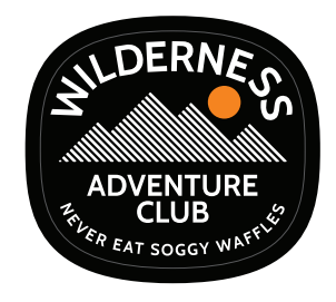
OD283 | Screen Printed Patch