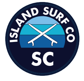
OD289 | Rubber Patch