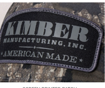
SCREEN PRINTED PATCH