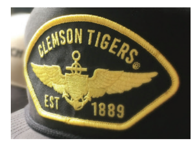
CL122 | EMBROIDERED PATCH