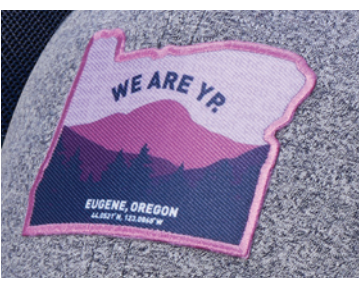
LASER CUT SUBLIMATED PATCH