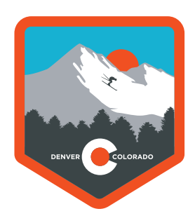
OD253 | Woven Patch

OD098 | Woven Label Featured on style 324, page 20