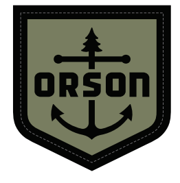
OD326 | Faux Leather Applique