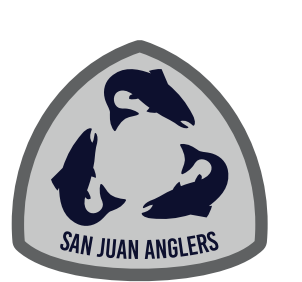
OD056 | Screen Printed Patch