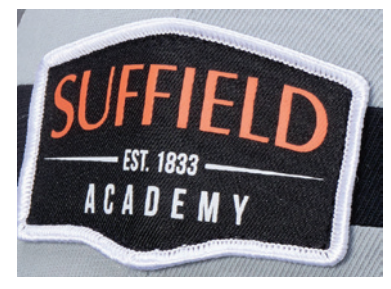
OD086 | SCREEN PRINTED PATCH