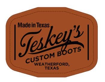
OD323 | Debossed Leather Applique Featured on style 312, page 21