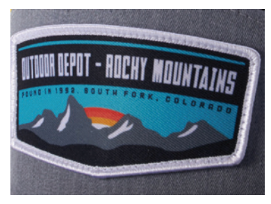
CL173 | SUBLIMATED PATCH

Simple shape patches have a merrowed edge and are hand stitched to the cap, complex shape patches have a satin stitched edge and are heat pressed to the cap Max Size: 2 ¼"H X 4 ½" W