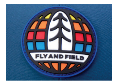
OD028 | RUBBER PATCH