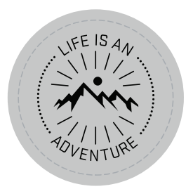
OD110 | Screen Printed Label