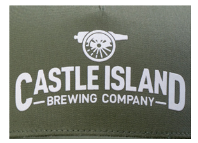
OD338 | ONE COLOR SCREEN PRINT TRANSFER