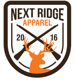
OD258 | Woven Patch Featured on style 843, page 26