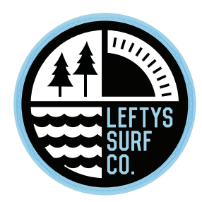
WL268 | Rubber Patch