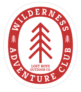
OD282 | Screen Printed Patch