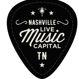
OD252 | Woven Label Featured on style R55, page 19