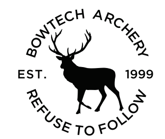
OD118 | Screen Print Transfer