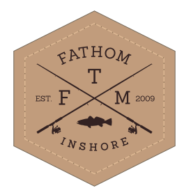
OD325 | Leather Applique Featured on style 510, page 17