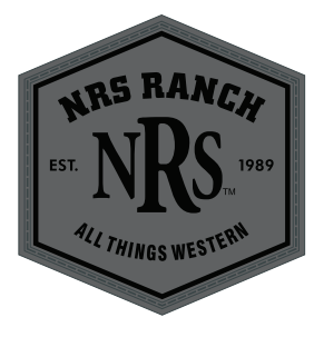
OD089 | Rubber Patch