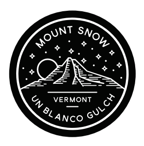
OD278 | Screen Printed Patch Featured on style 148, page 28