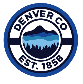
OD240 | Embroidered Patch