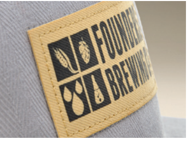
OD109 | SUBLIMATED LABEL