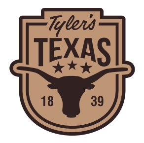
OD314 | Heat Pressed Leather Featured on style 112P, page 24