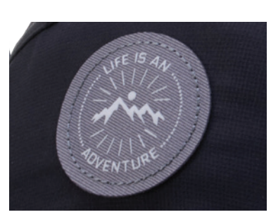
OD110 | SCREEN PRINTED LABEL