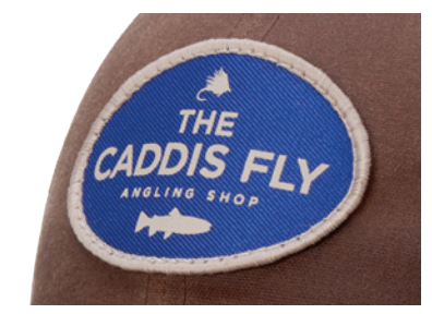
SCREEN PRINTED PATCH