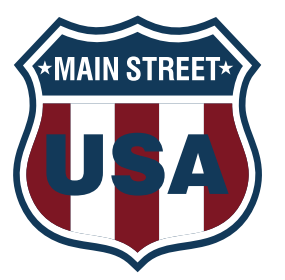
OD237 | Standard Embroidery Featured on style 112PM, page 12