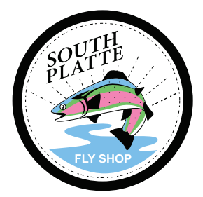
OD277 | Sublimated Patch Featured on style 112P, page 10