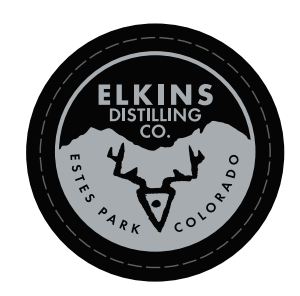
OD313 | Faux Leather Applique Featured on style 110, page 14