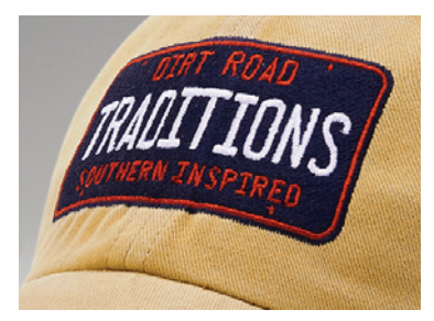
CL112 | STANDARD EMBROIDERY

The rich look of direct embroidery is a proven decoration method commonly used on baseball style caps. Whether it's your own custom logo or one of our stock name drops, mascots or team letters, our direct embroidery will make your cap stand out. We also specialize in raised, 3D embroidery.