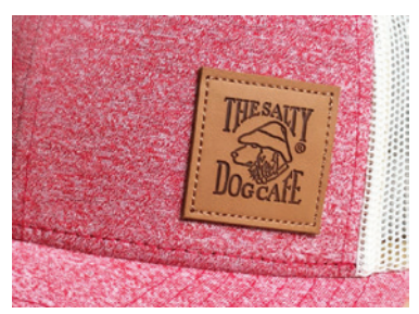
FAUX DEBOSSED LEATHER, BROWN IMPRINT