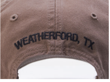
SECONDARY POSITION EMBROIDERY