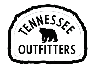
OD247 | Distressed Embroidered Patch