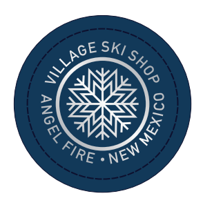
CL210 | Metallic Faux Leather Applique