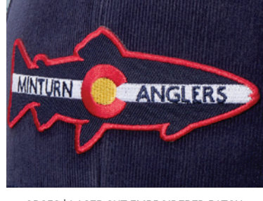
OD250 | LASER CUT EMBROIDERED PATCH