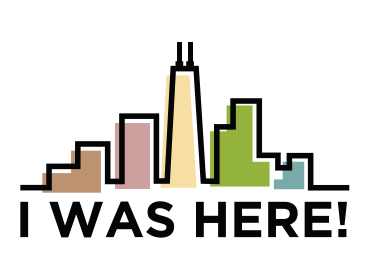
OD234 | Standard Embroidery