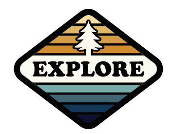
OD251 | Woven Patch Featured on style 174, page 23