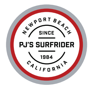
CL215 | Sublimated Patch Featured on style 168, page 15