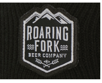
LASER CUT WOVEN PATCH