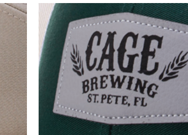
OD217 | GENUINE ETCHED LEATHER APPLIQUE