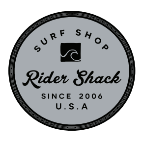
0D288 | Rubber Patch