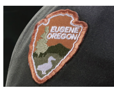
OD040 | LASER CUT EMBROIDERED PATCH