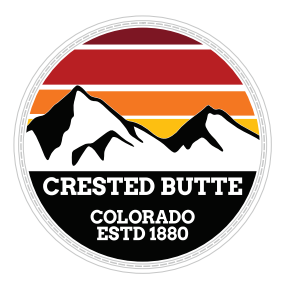
OD286 | Rubber Patch Featured on style 931, page 4