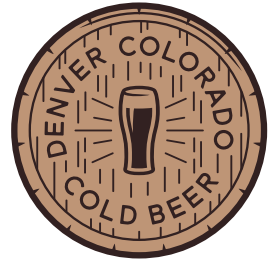
0D324 | Heat Pressed Leather Featured on style 255, page 16