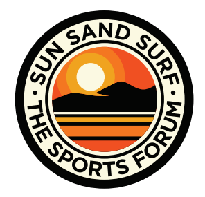
OD246 | Embroidered Patch Featured on style 254RE, page 1