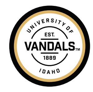
CL215 | Sublimated Patch