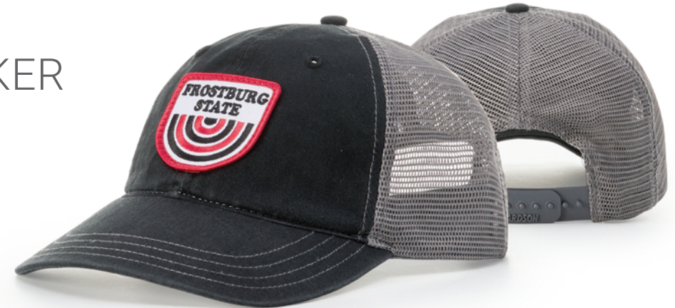
TRI-COLORS: First color is crown front panels and eyelets. Second color is crown back mesh panels, backstrap, and contrast stitching on crown front panels and visor. Third color is visor and button.