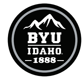
OD249 | Embroidered Patch