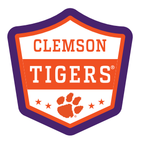
CL229 | Embroidered Patch