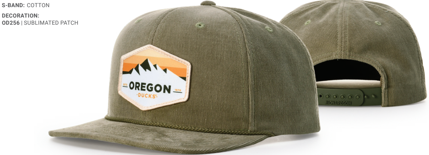
SOLID COLORS: Undervisor is cap color.