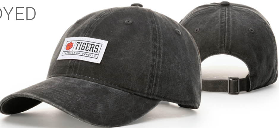
COLORS: Undervisor is cap color.