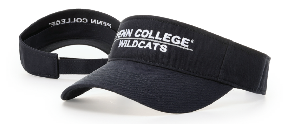
COLORS: Undervisor is cap color.