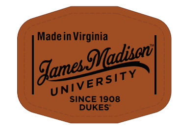
OD323 | Debossed Leather Applique