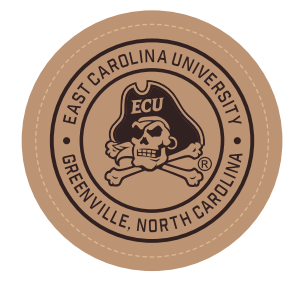
CL217 | Genuine Leather Applique