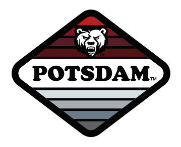
OD251 | Woven Patch