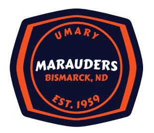
CL226 | Sublimated Patch

SUBLIMATED I SCREEN PRINTED | RUBBER PATCHES