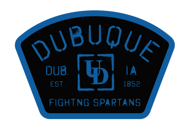
CL177 | Sublimated Patch