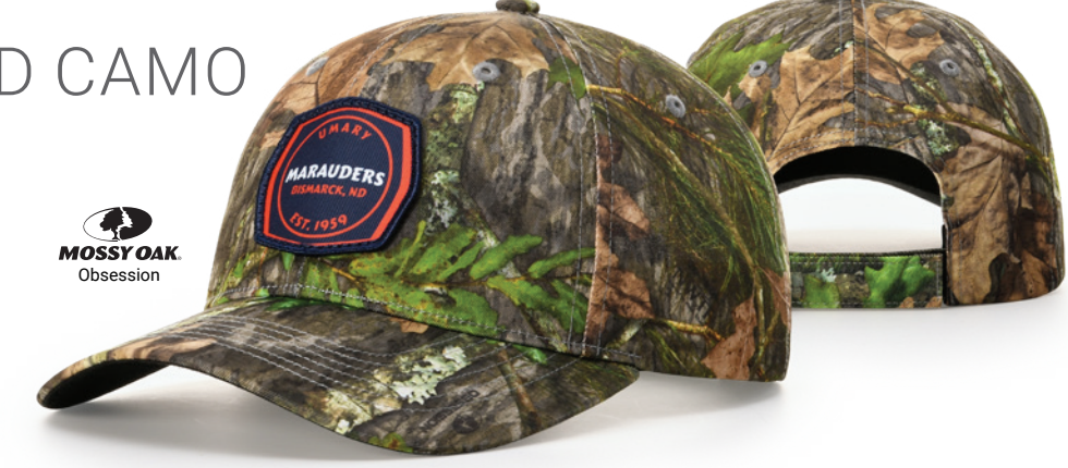
COLORS: Undervisor is camo pattern. Digital Camo undervisor is Driftwood