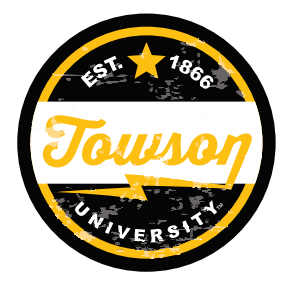
OD271 | Sublimated Patch