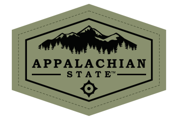
OD316 | Faux Leather Applique