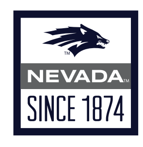
OD241 | Woven Patch