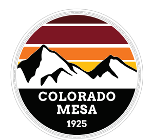
OD286 | Rubber Patch