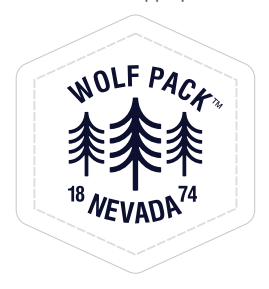
OD257 | Woven Label Applique