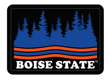
OD242 | Embroidered Patch