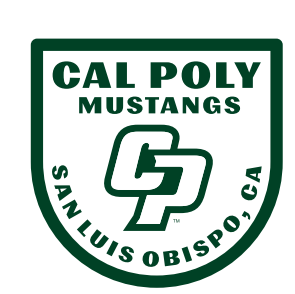
CL143 | Woven Patch