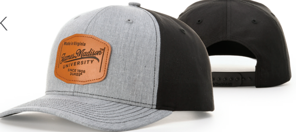
COLORS: First color is crown front panels, button, visor and undervisor. Second color is back panels and contrast stitching on front panels and visor.