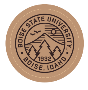
CL180 | Genuine Leather Applique