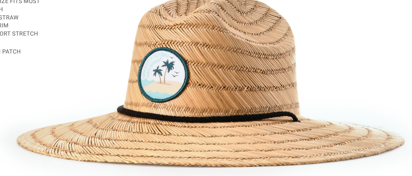
COLORS: Undervisor is straw.