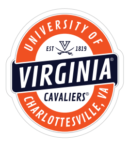
OD225 | Sublimated Patch