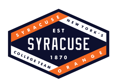
CL145 | Rubber Patch