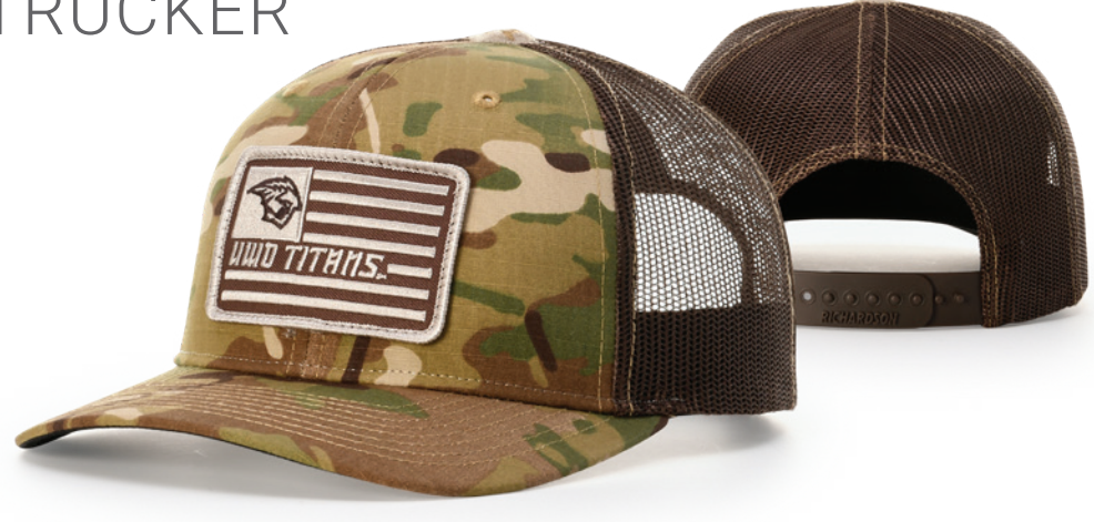
COLORS: Undervisor is camo pattern. Digital Camo undervisor is Driftwood.