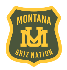
CL104 | Embroidered Patch